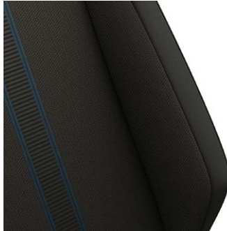
Black – Ravenna Blue – Titanium Black (Optional on Design)