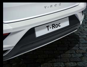
Loading sill protection Transparent