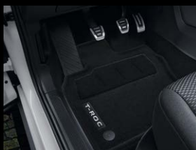
Textile footmat Front and rear, with T-Roc lettering, 1 set = 4 pieces