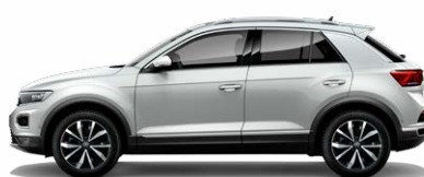
White Silver Metallic