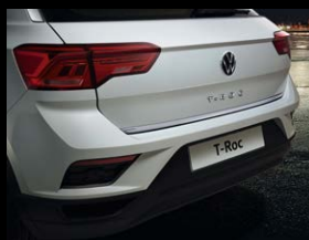
Protective strip for the tailgate Chrome look