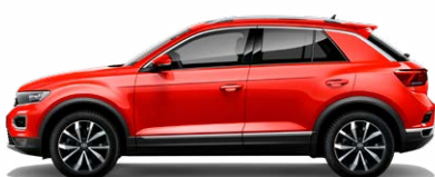
Flash Red Non-Metallic