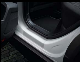
Protective film for the sill rail Rear, transparent