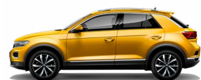
Curcuma Yellow (Only available on Design model) Metallic