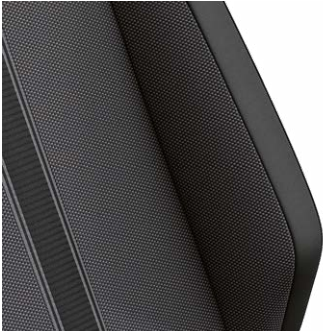
Black Oak – Ceramique – Titanium Black (Optional on Design)