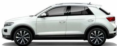
Pure White Non-Metallic