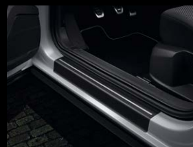
Protective film for the sill rail Front, black / silver