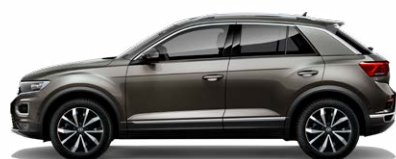
Indium Grey Metallic