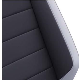
Quartzite – Ceramique – Titanium Black (Standard on R-Line and Optional on Design)