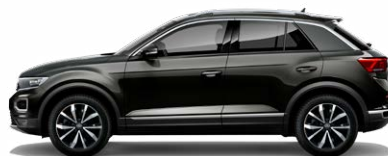
Urano Grey Non-Metallic