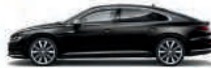
Deep Black Pearl