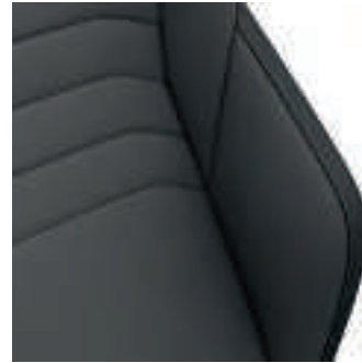
Leather 'Nappa' Titanium Black (TO)