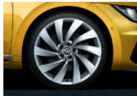
'Rosario' 20" alloy wheels (R-Line - optional)