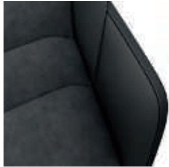
Leather 'Vienna' Black (OH)