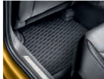
All-weather mat - rear, Titanium Black