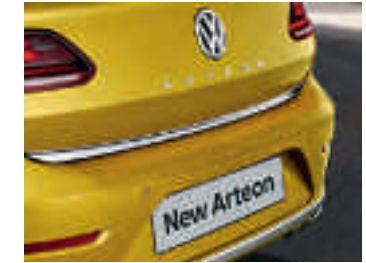
Loading sill protection - transparent