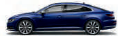
Atlantic Blue Metallic