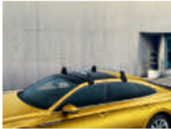
Roof bar set