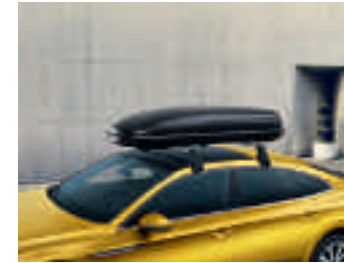
Roof box - 340 litres, matt black