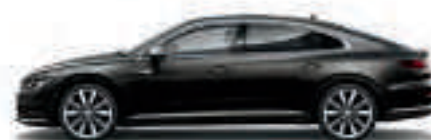
Manganese Gray Metallic