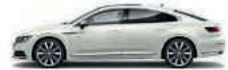
Oryx White Pearl