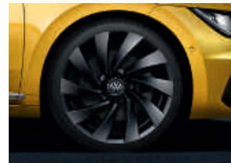
'Rosario Dark Graphite' 20" alloy wheels (R-Line - optional)