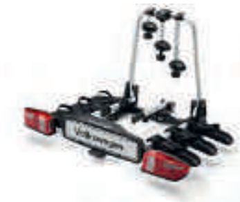
Bicycle carrier for the towing hitch - 3 bicycles