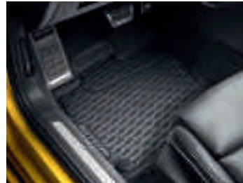
All-weather mat - front, Titanium Black