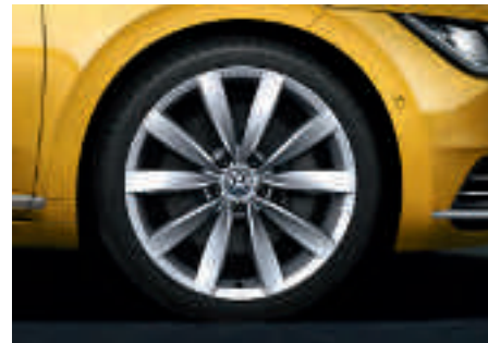
'Chennai' 19" alloy wheels (Elegance – optional)