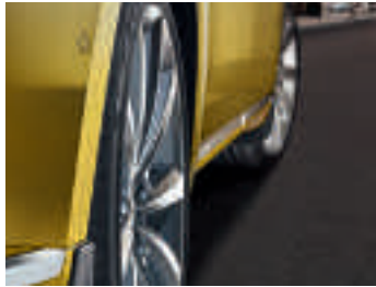
Front mud flap