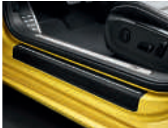
Protective film - for side sill front and rear doors, black with silver stripe