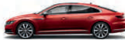
Chili Red Metallic