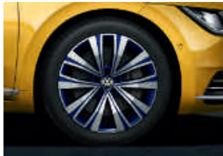
'Muscat' 18" alloy wheels (Elegance – standard)