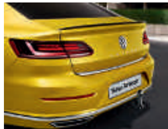
Towing hitch (kit)