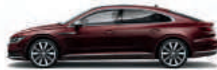
Crimson Red Metallic