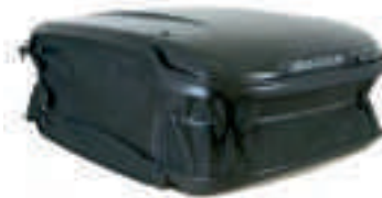
Roof box - 300-500 litres, Urban Loader, matt black