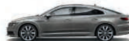
Pyrit Silver Metallic