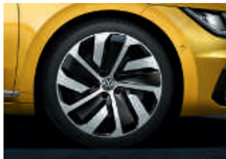
'Montevideo' 19" alloy wheels (R-Line – standard)