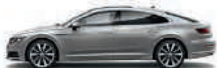
Reflex Silver Metallic