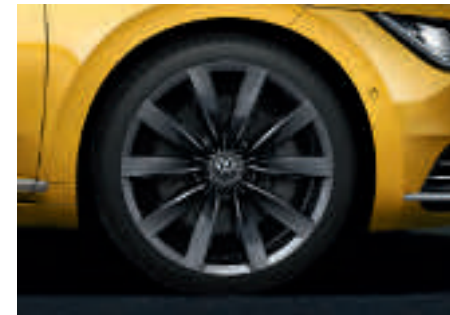
'Chennai Adamantium' 19" alloy wheels (Elegance - optional)