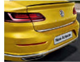
Protective strip for tailgate - chrome look