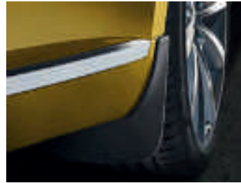
Rear mud flap