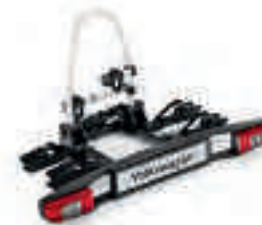
Bicycle carrier for the towing hitch - 2 bicycles