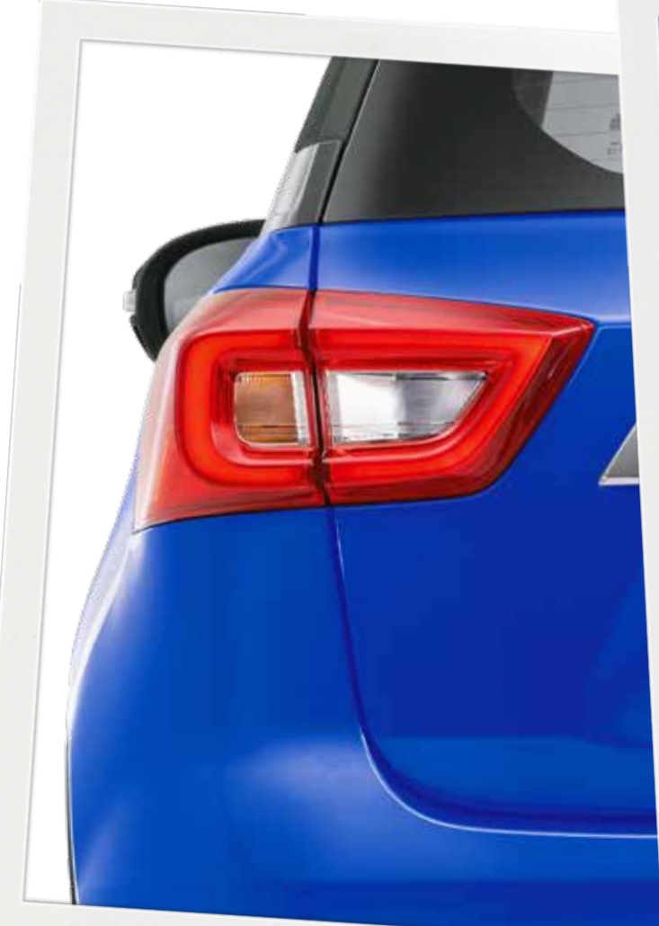
LED rear lights