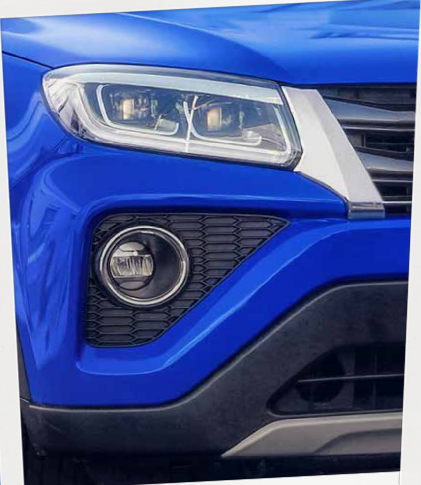
LED front tog lamps*