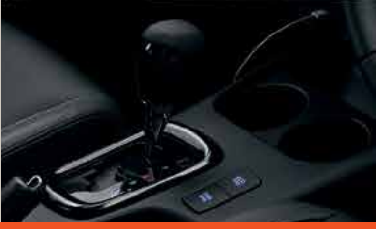
EATHER-CLAD GEAR SELECTOR*