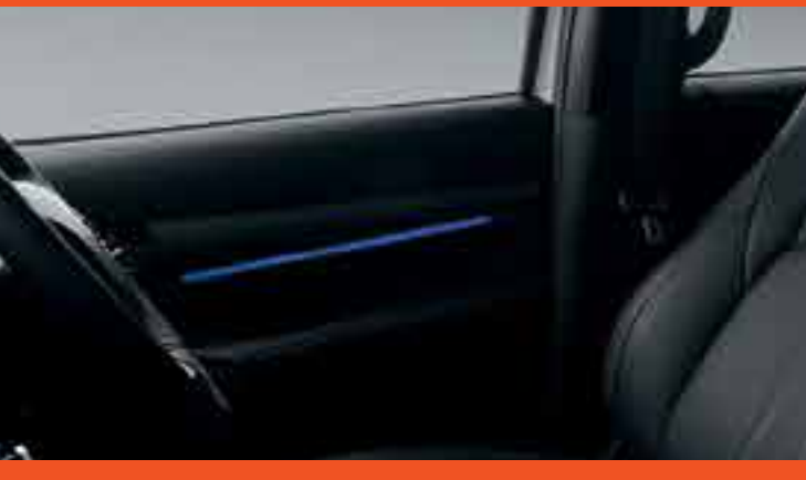
BLUE AMBIENT LIGHTING*