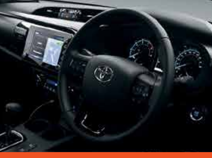
LEATHER-CLAD STEERING WHEEL*

Occupants of Legend RS and 4.0 l V6 models enjoy leather seats (of which the driver seat is electrically adjustable) with perforation for better breathing, a leather-clad gear selector and steering wheel. The Legend models comes standard with Legend fabric seats.