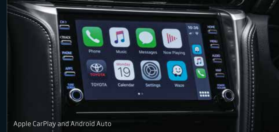
Apple CarPlay and Android Auto