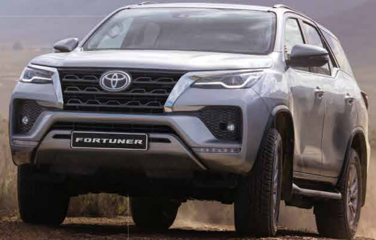
MODEL SHOWN: 2.8 GD-6 4x4 VX AT