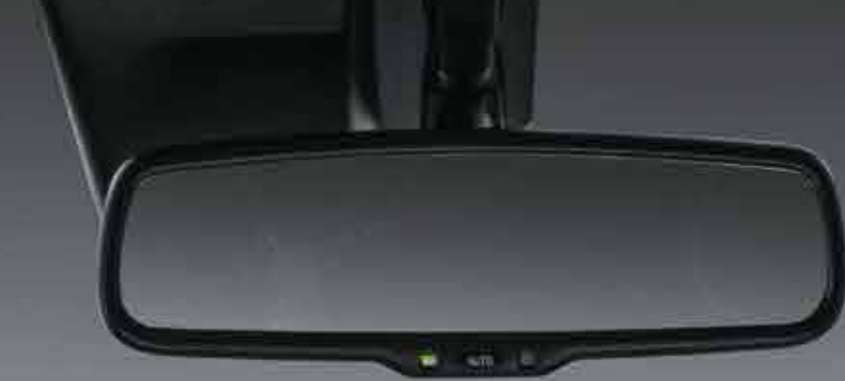
Electrochromatic rear view mirror

The Fortuner's technological dexterity continues with the infotainment system, which has been upgraded to an 8" touch screen unit which comprises Audio Visual Navigation*; Bluetooth and USB compatibility and is linked to six speakers. The screen also doubles as the display monitor for the vehicle's reverse camera.