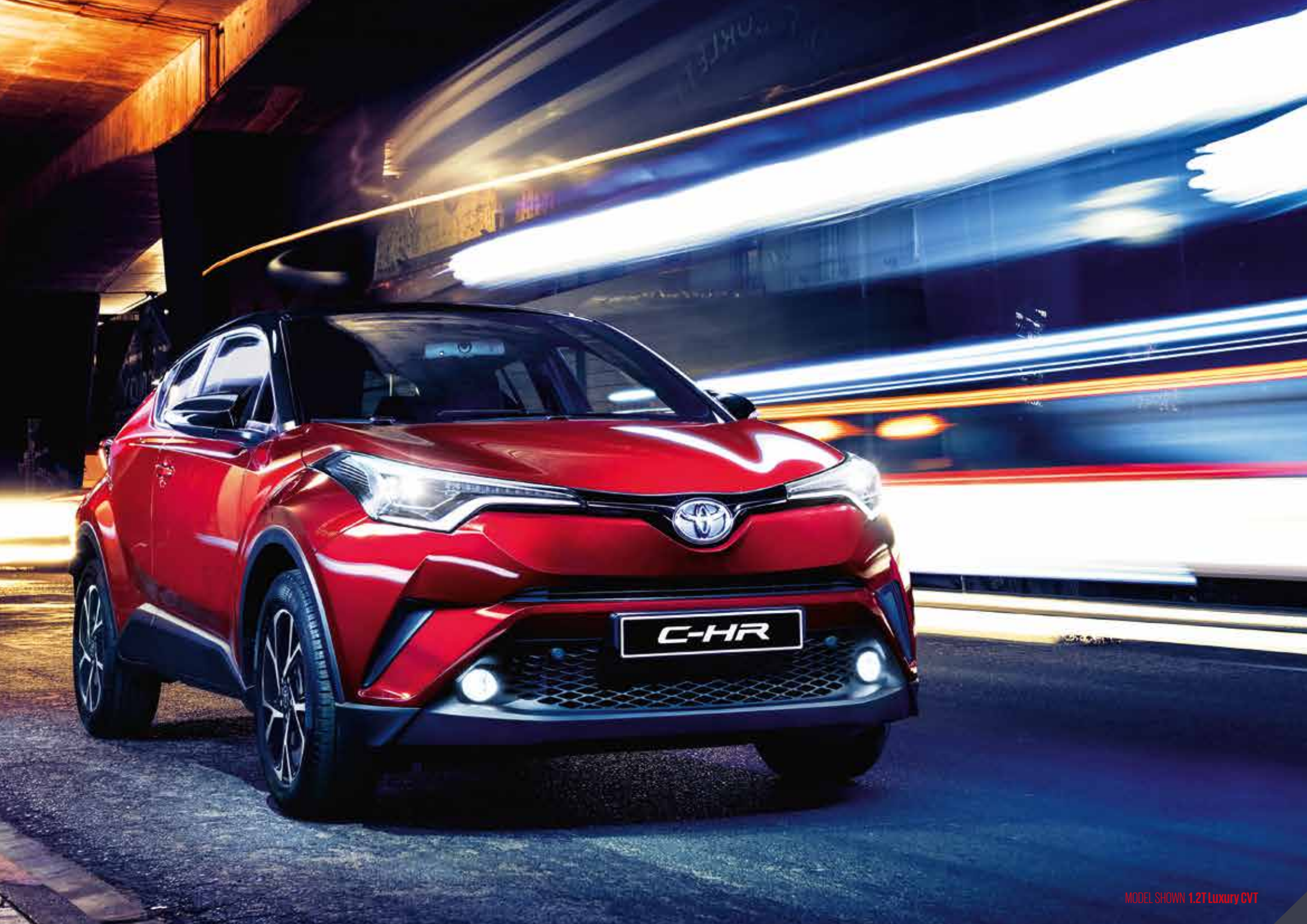
MODEL SHOWN 1.2T Luxury CVT