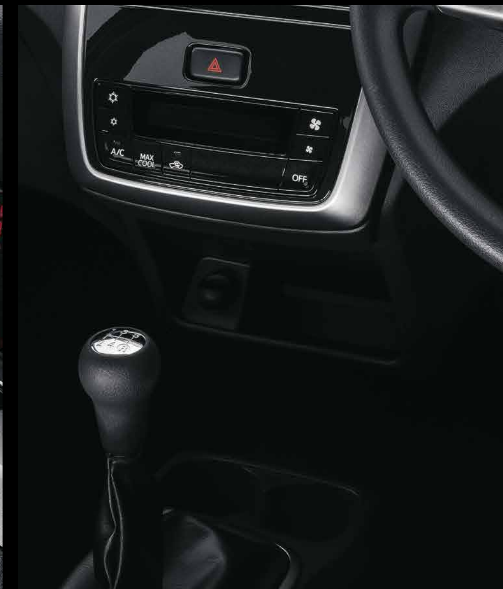
MODEL SHOWN: AGYA MT (WITH AUDIO)