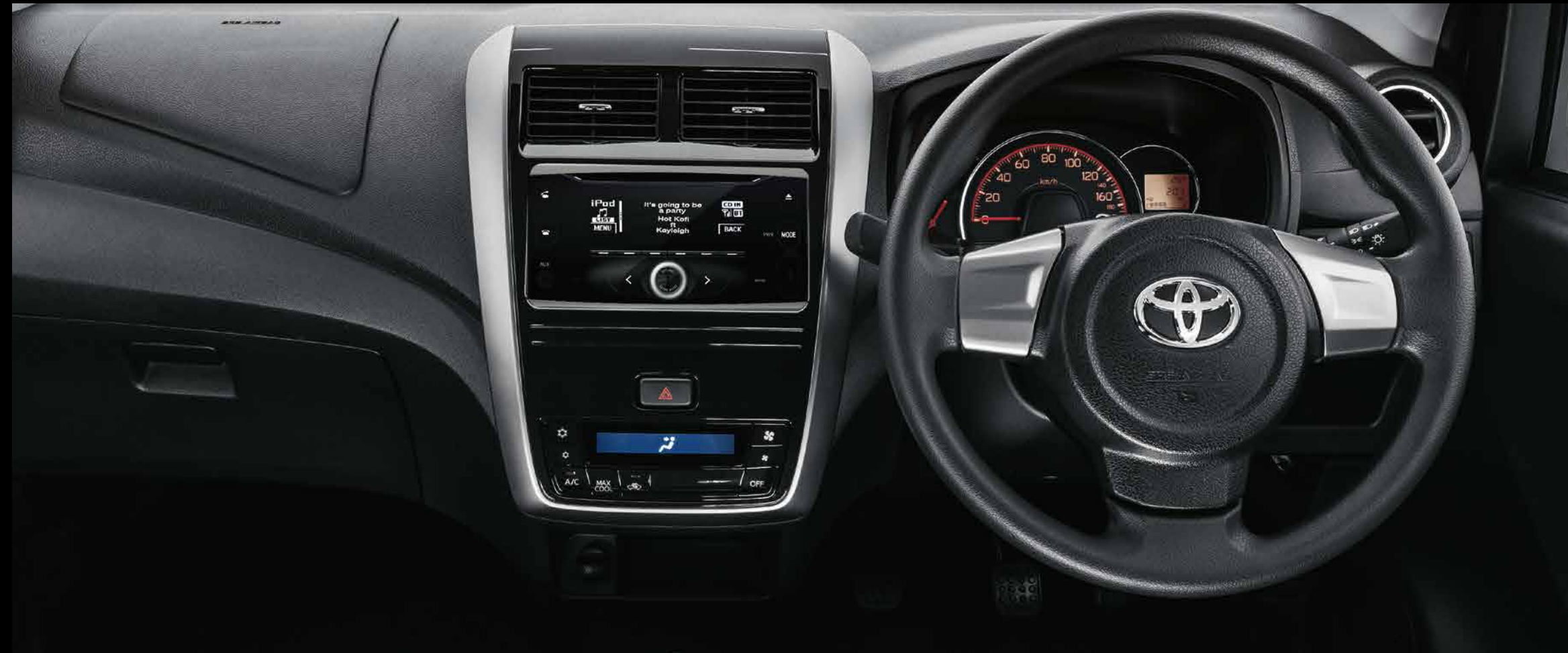
MODEL SHOWN: AGYA MT (WITH AUDIO)

And we're just getting started. Powering up your Agya experience is a Push Start button, which means the vehicle can be started without the key fob being removed from the driver's pocket or handbag.