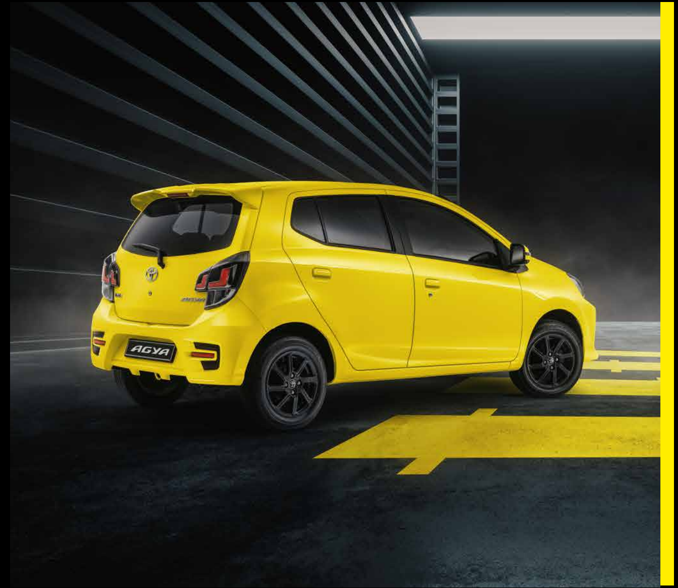
MODEL SHOWN: AGYA MT