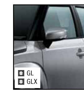
Uptown Red Metallic - with black roof