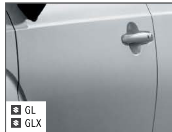
Silky Silver Metallic