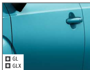
Turquoise Blue Pearl Metallic