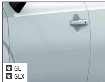
Arctic White Pearl