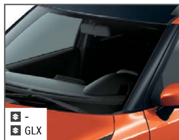
Lucent Orange & Midnight Black