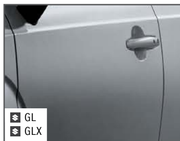
Glistening Grey Metallic