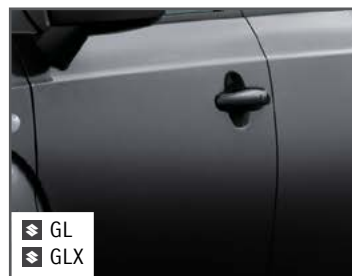
Midnight Black Pearl Limited