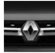
COMET GREY (METALLIC) Available early 2016