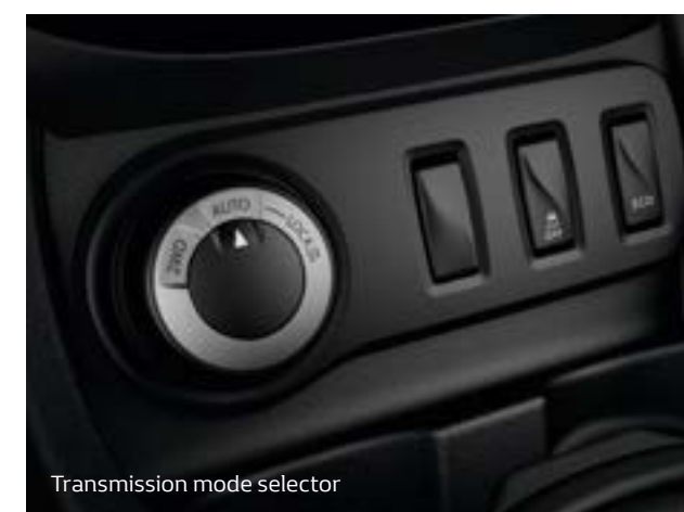
Transmission mode selector

The second is the diesel 1.5dCi engine with outputs of 80kW and 240Nm. Both engines are very fuel efficient with the petrol using 7.6l/100km and the diesel 4x2 just 4.8l/100km.