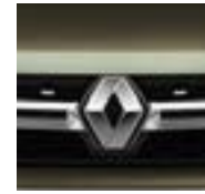
OLIVE GREY (METALLIC)