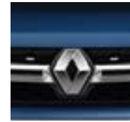
COSMOS BLUE (METALLIC) Available late 2015

Printed September 2015 CUBE DESIGN • 011 454 6160 • 091 56306