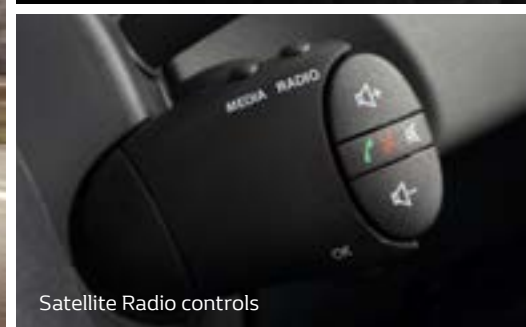
Satellite Radio controls

What's more, in Dynamique trim, the Renault Duster features optional leather seats and a 7" touchscreen MediaNav® entertainment system as standard with built-in navigation.