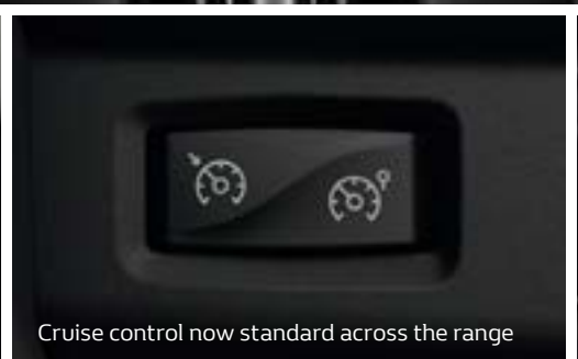
Cruise control now standard across the range