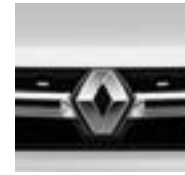
WHITE (NON METALLIC)