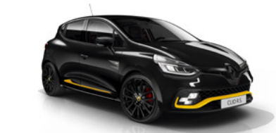
DIAMOND BLACK (METALLIC)