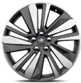
19" WASHINGTON two-tone diamond-cut alloy wheel rims Standard on GT Line