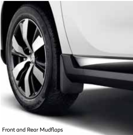
Front and Rear Mudflaps