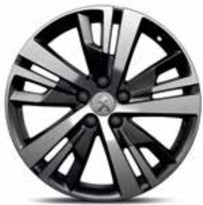
18" DETROIT two-tone diamond-cut alloy wheel rims Standard on Allure