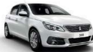
Pearl White (Pearlescent)