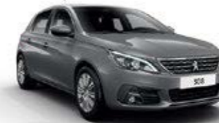
Artense Grey (Metallic)