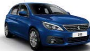
Magnetic Blue (Metallic)