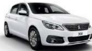
Bianca White (Solid)

Choose the colour that matches your character from the eight in our colour range.