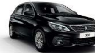
Perla Nera Black (Metallic)