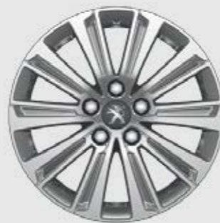
16" ZYRCON alloy wheels

Designed to complement the sharp exterior design, the new PEUGEOT 308 comes with the 16" ZYRCON alloy wheel.