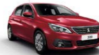
Ultimate Red (Special)