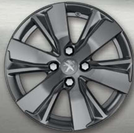
16" 'Hydre' Alloy Wheel