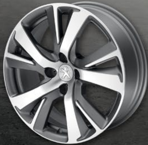
17" 'Eridan' Anthra Alloy Wheel