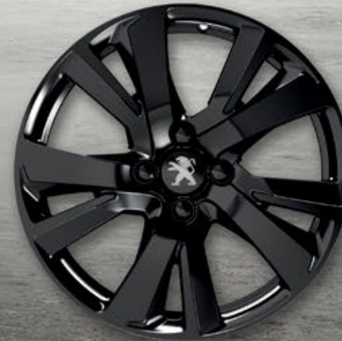
17" 'Eridan' Black Alloy Wheel (Optional on GT Line, on request only)