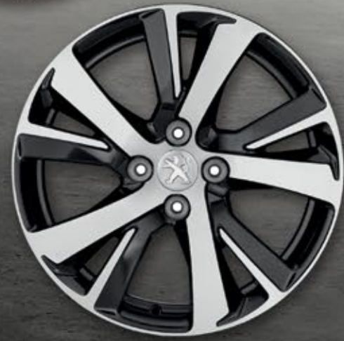
17" 'Eridan' Brilliant Black Alloy Wheel