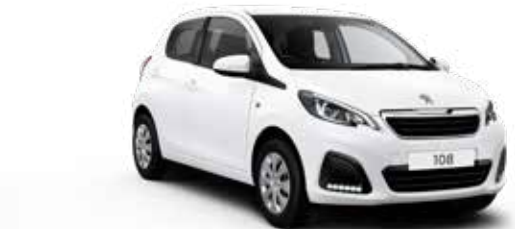
Lipizan White (Matte)