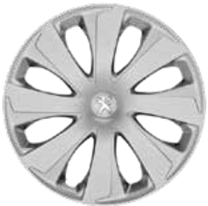
14 " Xavier wheel trim.