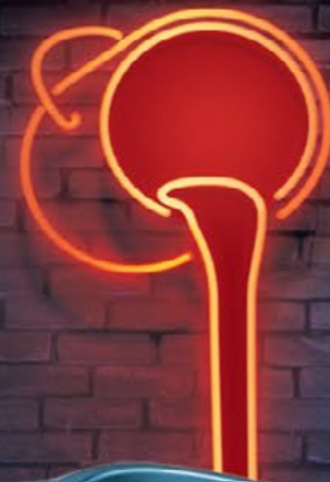
CLARET RED AY4 (M)