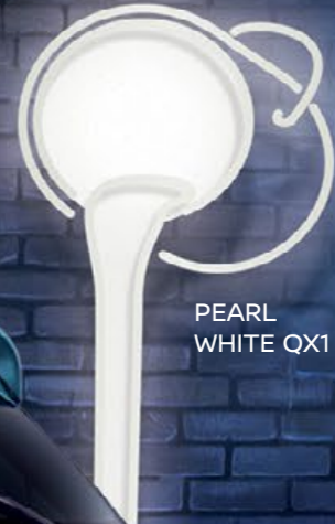
PEARL WHITE QX1 (M)