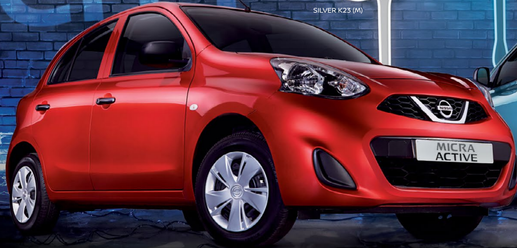
SILVER K23 (M)