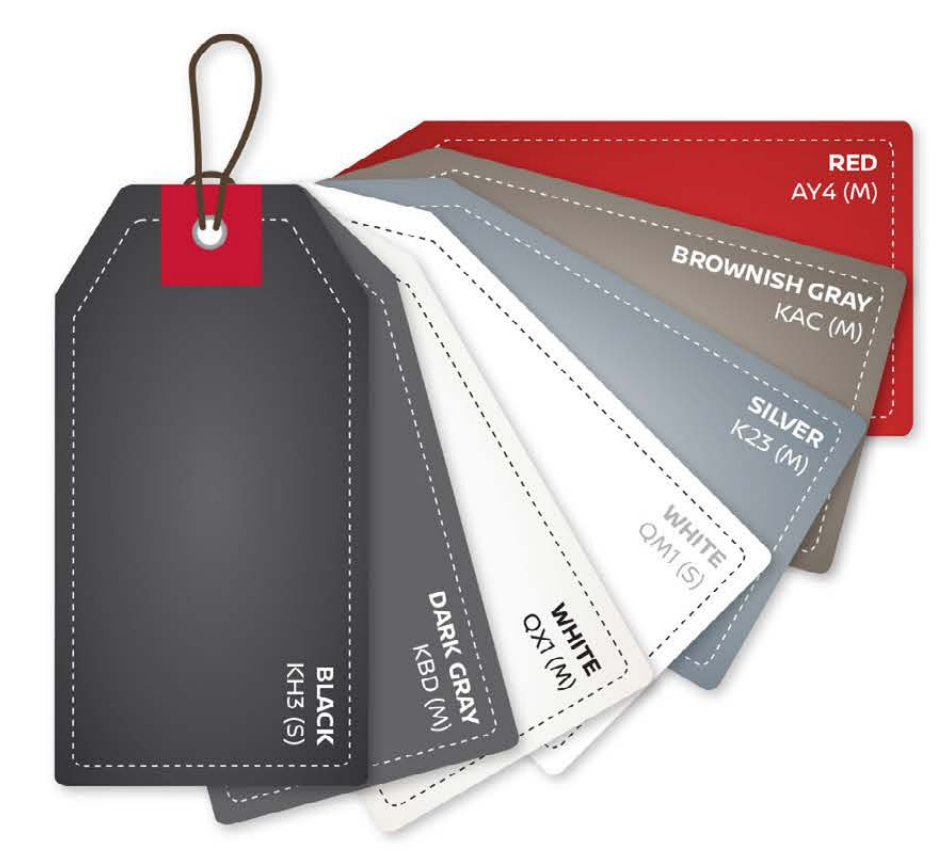
M – Metallic S – Solid