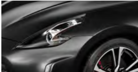
Diamond Black (M) G41