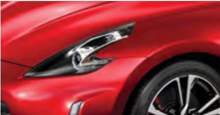
(NEW) Passion Red (NEW) (PM) NBA