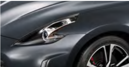
Gun Metallic (M) KAD