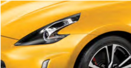
(NEW) Ultimate Yellow (S) EAC