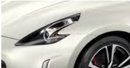
Pearl White (M) QAB