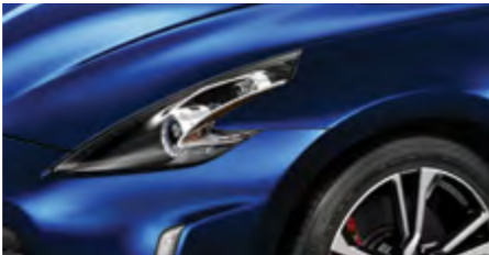
Aurora Flare Blue (P) RAY

S - solid M - metallic PM - pearl metallic