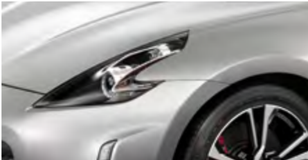
Brilliant Silver (M) K23