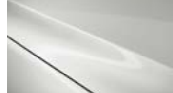
SNOWFLAKE WHITE PEARL