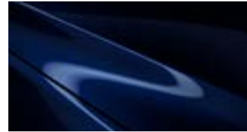
DEEP CRYSTAL BLUE