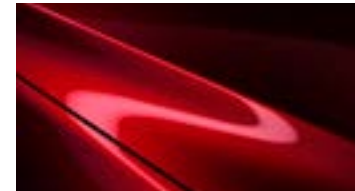
SOUL RED CRYSTAL