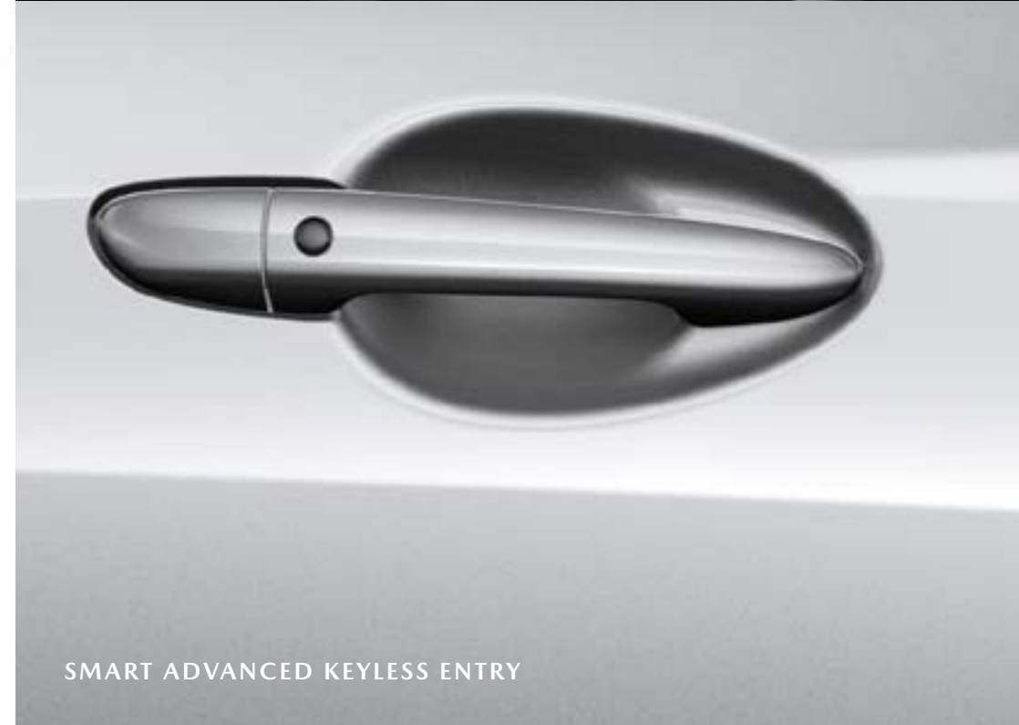
SMART ADVANCED KEYLESS ENTRY