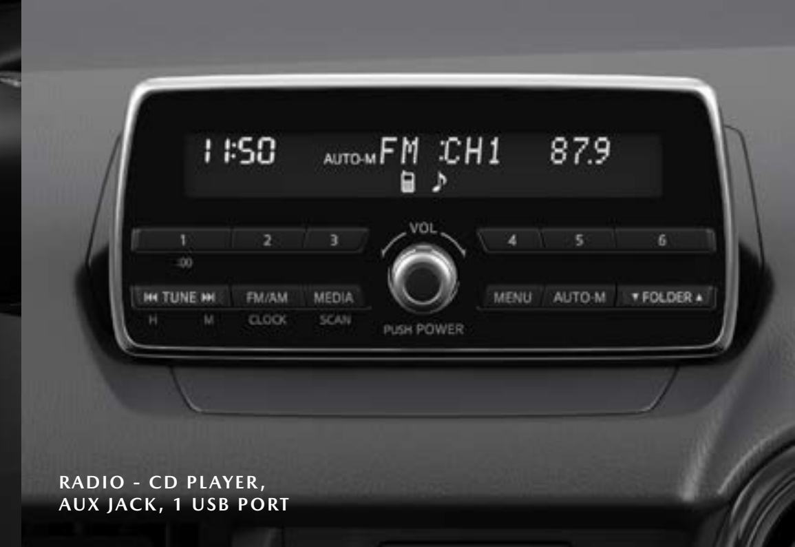
RADIO - CD PLAYER, AUX JACK, 1 USB PORT