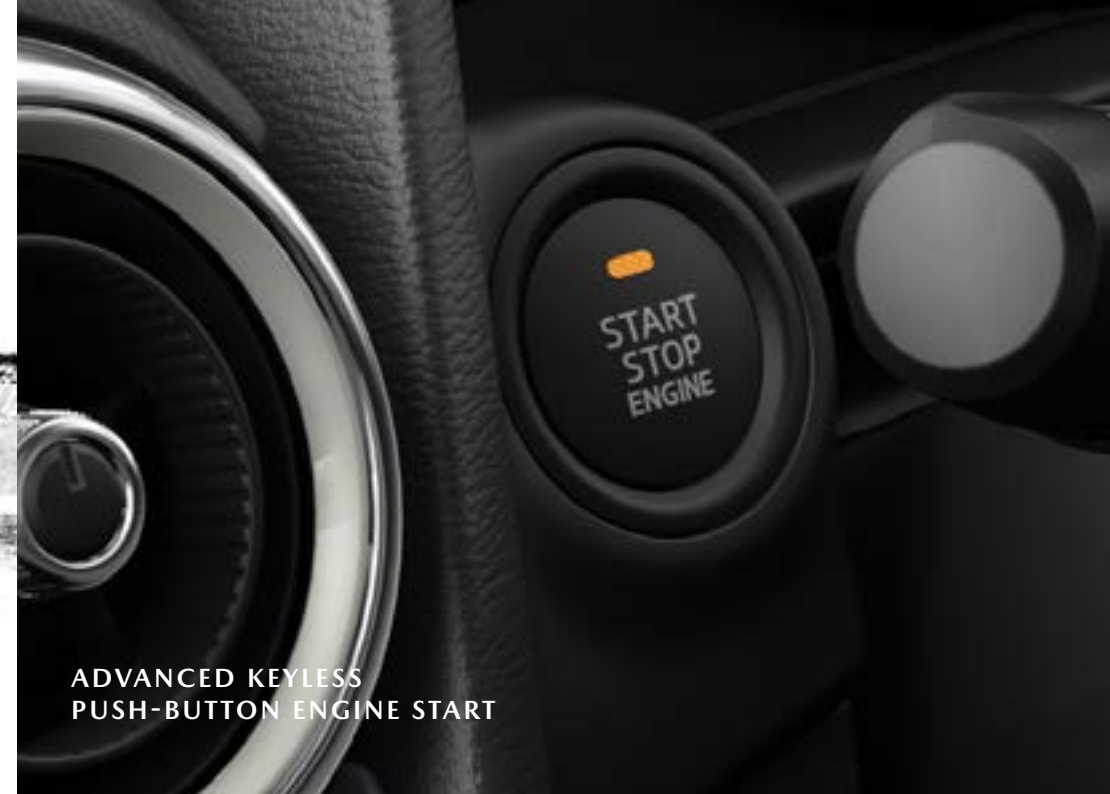
ADVANCED KEYLESS PUSH-BUTTON ENGINE START