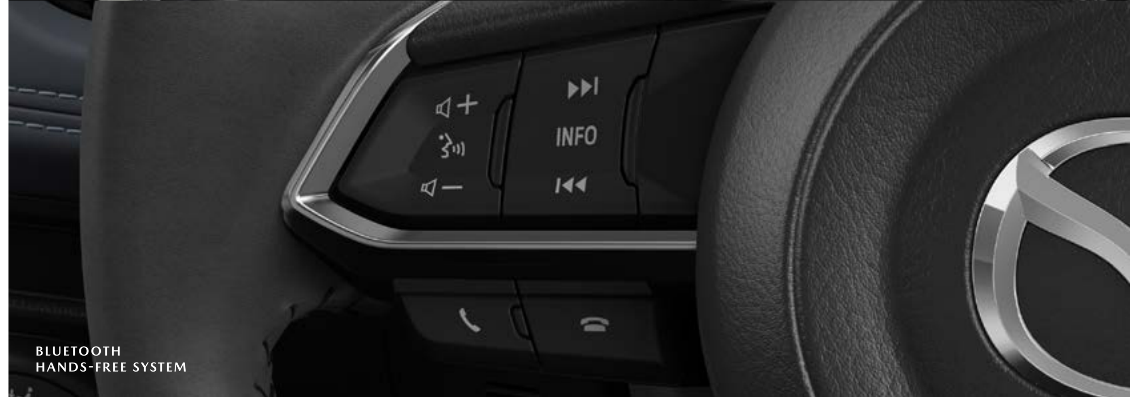
BLUETOOTH HANDS-FREE SYSTEM