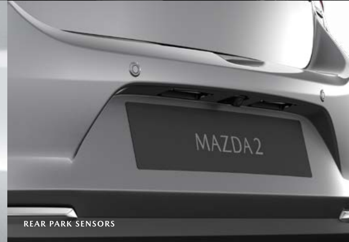
REAR PARK SENSORS