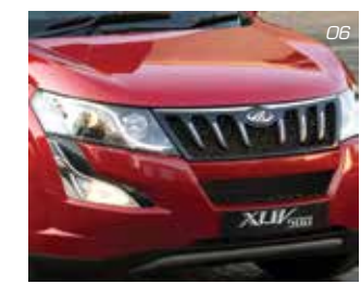
Opposite - These high-intensity projector headlamps put daylight between the New Age XUV500 and its competitors, with their unique ability to lighten up curves as you turn the wheel. There will never be a surprise around the corner.