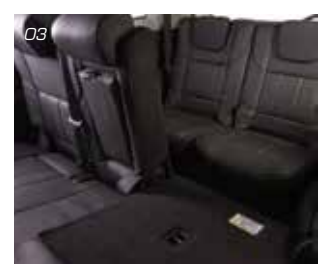
O1 - There is plenty of room for everyone in the New Age XUV500 with arguably more leg room in the second row than any other vehicle in its class. O2 - It seems there is no end to what you can fit into the spacious load bay, which provides great flexibility to meet your every requirement. O3 - 60:40 split second row seating and 50:50 in the third row. O4 - Convenient fingertip controls for all windows in the driver's door: O5 - Flip key with remote central locking

Features abound in the New Age XUV500 and they are all designed around you. From the Reverse Parking Camera with Dynamic Assist (W8) to get you safely into a tight bay, to the Lead-me-to-Vehicle Lamps that activate on command help you locate your vehicle at night. The follow-me-home headlights will also stay on to shine the way to your door when you get home. But it doesn't stop there either with a rear window demister