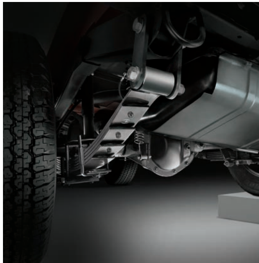
Above: The mechanical locking differential provides enhanced traction on loose and slippery surfaces without the need for pushbuttons, shift throws or other interventions.