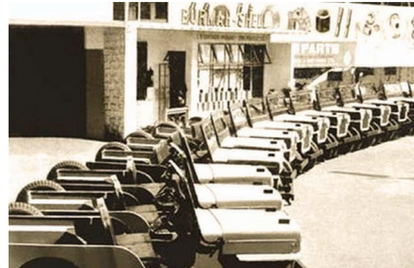
Early Mahindra vehicles assembled in front of the Kandivali factory, Mumbai (Circa 1949).