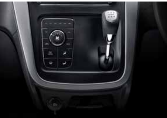
ELECTRONIC TEMPERATURE CONTROL PANEL