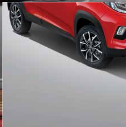
HIGH APPROACH & DEPARTURE ANGLES

Please note: Specifications, detailing and finishes differ on the various models available - please consult the specification sheet at the back of this brochure, or your dealer for more information.