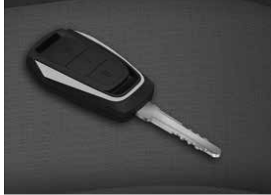
REMOTE KEYLESS ENTRY WITH IN-REMOTE OPENING TAILGATE