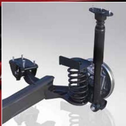
LONG TRAVEL SUSPENSION