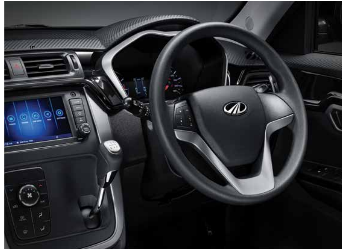
ELECTRIC POWER STEERING WITH STEERING MOUNTED CONTROLS