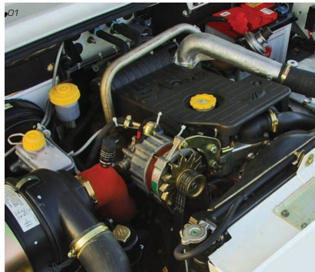
01 The Bolero's 2.5l NEF turbo diesel delivers 74 kW of power and 238 Nm of torque, pulling cleanly from 1800 rpm in third gear, providing great efficiency and excellent fuel economy across any terrain.