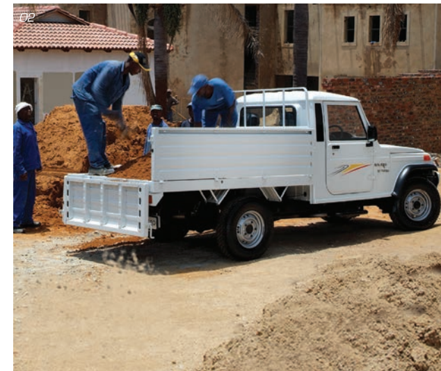
02 The high walls, fold down panels and easy to clean surface of the load box make it highly functional whatever your load, while the strong chassis provides the ideal base for heavy lifting.