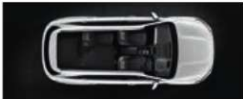
3 rd row folded fully flat and 2 nd row partially folded