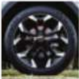
20" alloy wheel