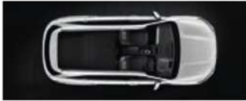
2 nd row folded fully flat

Bold on the outside, refined on the inside—it offers the ultimate blend of comfort, space, and flexibility. Whether you’re chasing adventure or cruising through the everyday, the Sorento ensures you do it all with effortless sophistication.