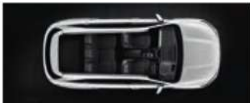
3 rd row folded fully flat