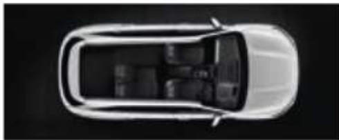
2 nd row partially folded