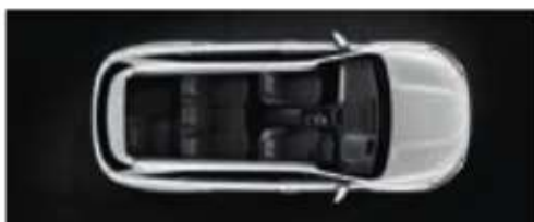
3 rd row partially folded