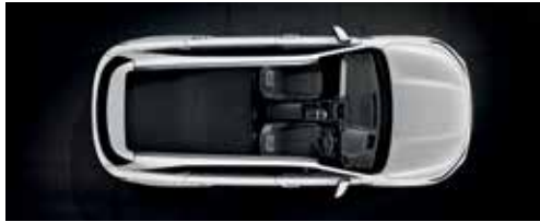
2 nd row folded fully flat

When your head says, "let's push boundaries", the Sorento says, "let's do it in style". That's why you'll find the ultimate in comfort, space, and flexibility wrapped inside its bold exterior design.