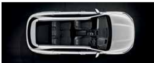
3 rd row folded fully flat