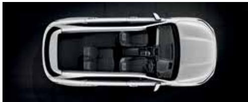
2 nd row partially folded