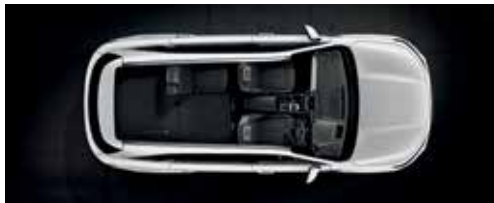
3 rd row folded fully flat and 2 nd row partially folded