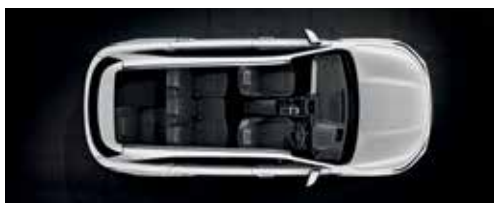
3 rd row partially folded