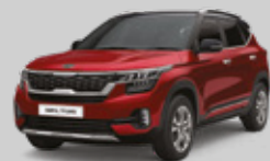
Roof: Aurora Black Pearl Body: Intense Red