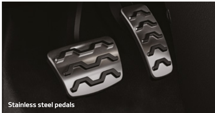
Stainless steel pedals