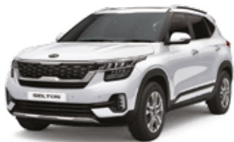
Glacier White Pearl