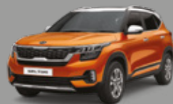
Roof: Clear White Body: Punchy Orange