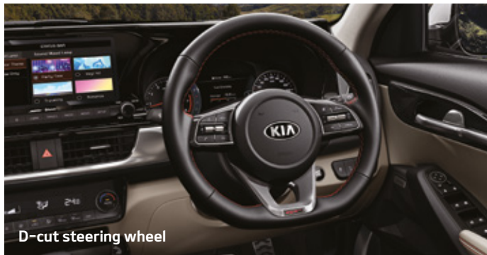
D-cut steering wheel