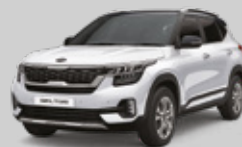
Roof: Aurora Black Pearl Body: Glacier White Pearl