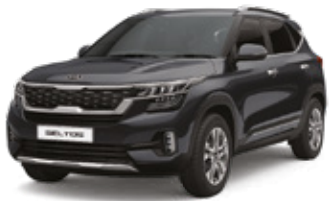
Aurora Black Pearl