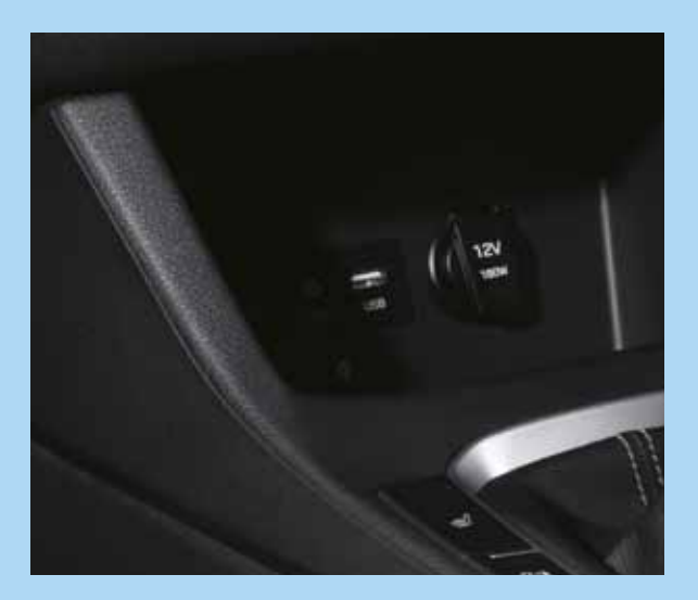
USB and Wireless Smartphone Charging