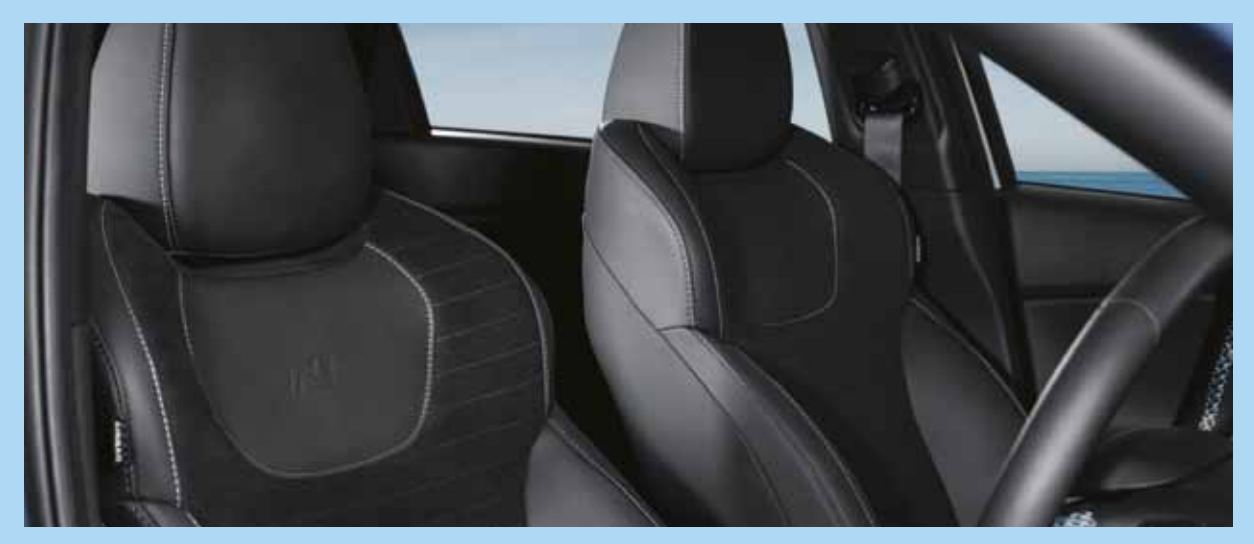
Artificial Suede and Leather

The interior of the i30 N is made to awake all the senses. It starts with sports front seats, designed to provide exceptional support and comfort and the bespoke N steering wheel with dedicated N-mode button, as well as an N-specific race computer which features a lap timer, G-force meter, boost gauge and launch control.