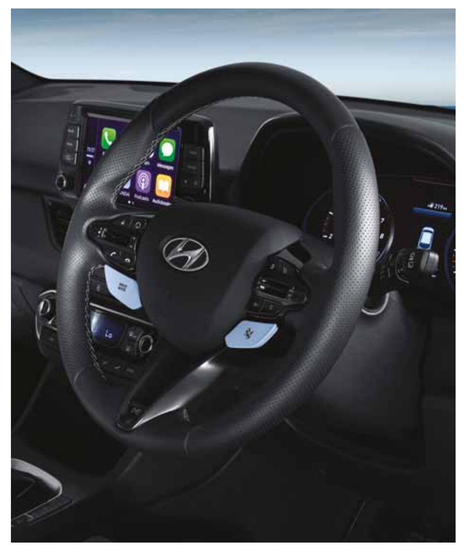
Multifunctional Steering Wheel