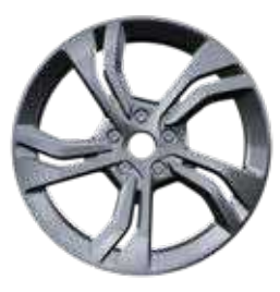
Ambiente & Trend: 18" Alloy Wheel