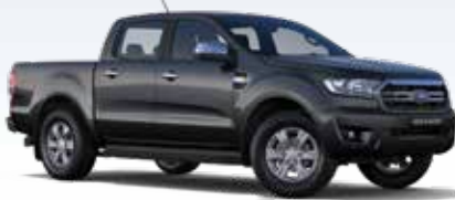
Sea Grey (Metallic*)