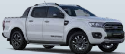
Frozen White (Solid)