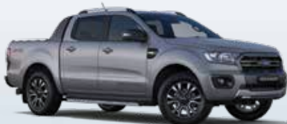
Moondust Silver (Metallic*)