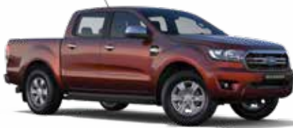
Copper Red (Metallic*)