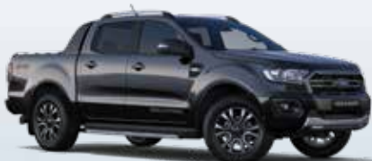
Absolute Black (Metallic*)