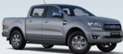
Moondust Silver (Metallic*)