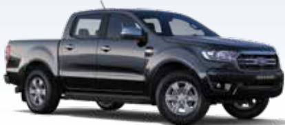
Absolute Black (Metallic*)