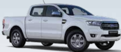
Frozen White (Solid)