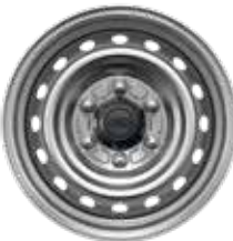
16" Steel wheel