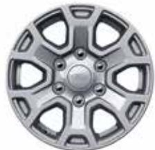
16" Alloy wheel also available as an option on XL derivatives, at an additional cost.