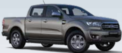
Diffused Silver (Metallic*)