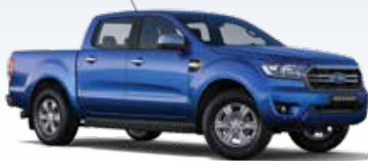
Blue Lightning (Solid)