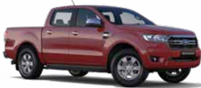
Colorado Red (Solid)