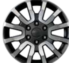
18" Alloy wheel available on Wildtrak only.