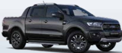
Sea Grey (Metallic*)