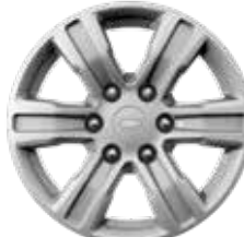
17" Alloy wheel available in Silver, and Black as an option on XLS, and XLT derivatives, at an additional cost. Also available in Black only as an option on XL.