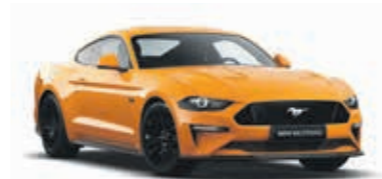
Orange Fury (Metallic)