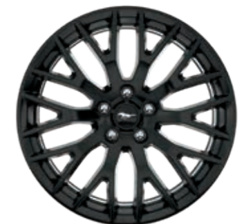
19"x9" (F) 19"x9.5" (R) Ebony Black-painted Aluminium (Standard on 5.0L V8)