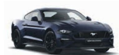
Kona Blue (Metallic)