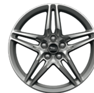
19"x9" Luster Nickel-painted Forged Aluminium (Optional on 2.3L and 5.0L V8)