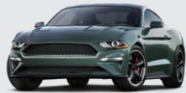
Dark Highland Green

10 minutes and 53 seconds. That's all it took for the New MUSTANG to drive into cinematic history and become an icon for generations to come. 50 years after what critics call one of the best car chase scenes of all time, the legend is back. In all its glory, power and prestige, the 50th anniversary edition MUSTANG BULLITT is here.