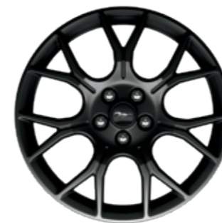
19"x9" Low-gloss Ebony Black-painted Aluminium (Standard on 2.3L)