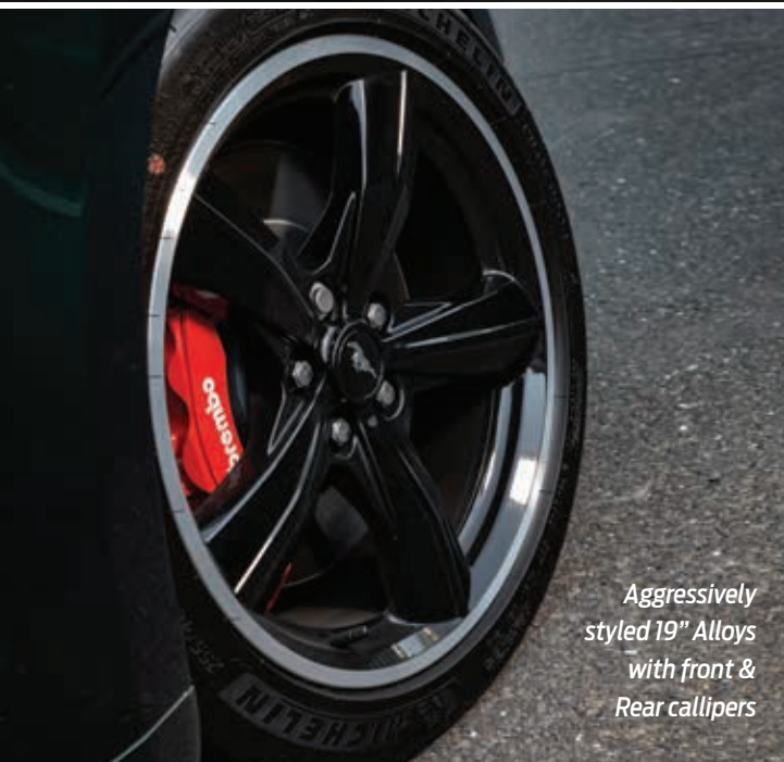
Aggressively styled 19" Alloys with front & Rear callipers