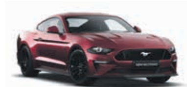
Ruby Red (Metallic)