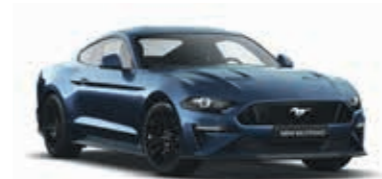
Velocity Blue (Metallic)