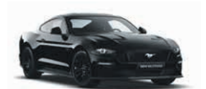
Shadow Black (Metallic)