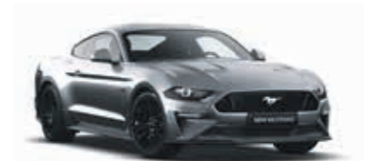
Ingot Silver (Metallic)