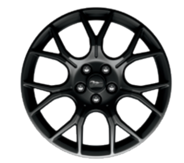
19"x9" Low-gloss Ebony Black-painted Aluminium (Standard on 2.3L)