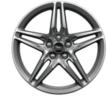
19"x9" Luster Nickel-painted Forged Aluminium (Optional on 2.3L and 5.0L V8)