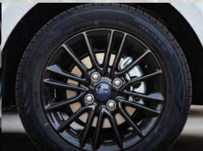
15" Alloy wheels – black