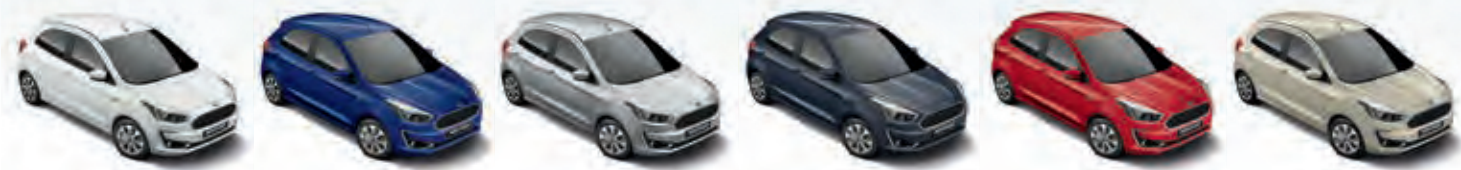
Oxford White (Solid) Deep Impact Blue (Metallic*) Moondust Silver (Metallic*) Smoke (Metallic*) Ruby Red (Metallic*) White Gold (Metallic*) (Available on Trend and Titanium models only)

Every aspect of the new FIGO has been thoughtfully crafted. A bold exterior that turns heads and an interior aimed to give you a new perspective.