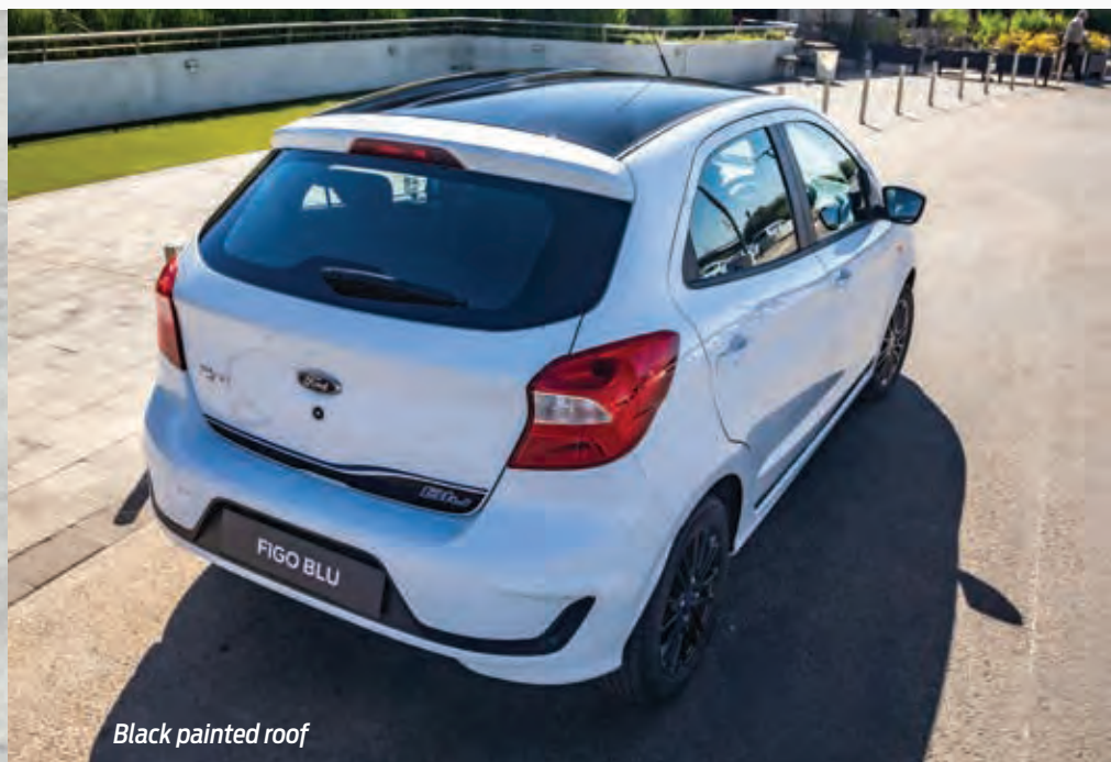
Black painted roof