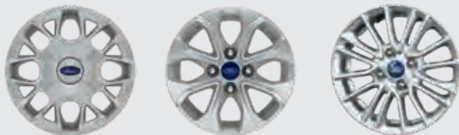
14" Steel wheel cover – 175/65 R14 Available on Ambiente models 14" Alloy wheel – 175/65 R14 Available on Trend models 15" Alloy wheel – 175/65 R15 Available on Titanium models only