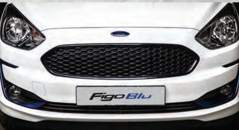
Black mesh grille