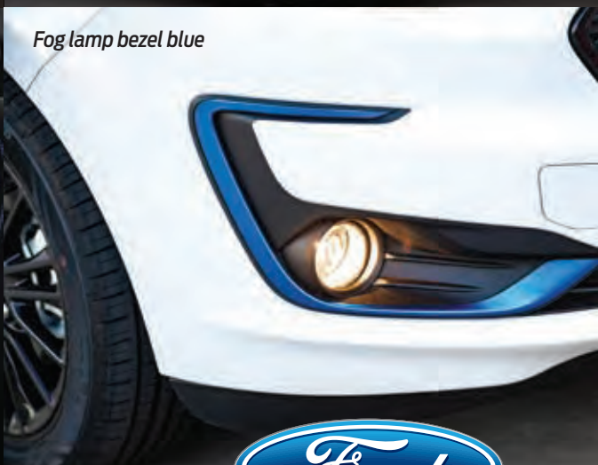
Fog lamp bezel blue

Blu package is only available on Figo 1.5 Trend 5-door M/T. Printed in South Africa. Published by Ford Motor Company. © 2019 Ford Motor Company.