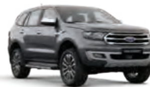
Sea Grey (Metallic*)