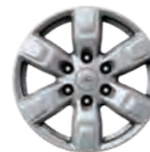
17" Alloy Wheel 265/65 R17 Standard on XLS derivatives only.