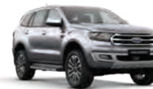
Moondust Silver (Metallic*)

*Note: Metallic body colors incur additional costs.