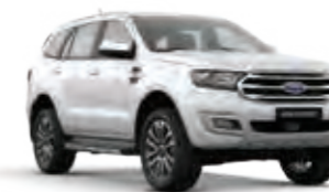
Frozen White (Metallic*)