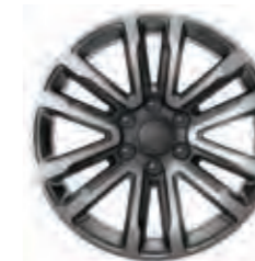
20" Alloy Wheel 265/50 R20 Standard on Limited derivatives only.