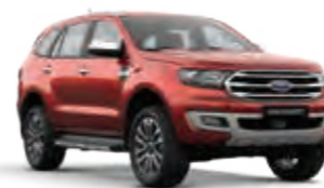
Copper Red (Metallic*)