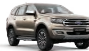
Diffused Silver (Metallic*)