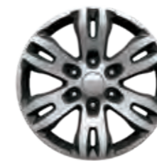
18" Alloy Wheel 265/60 R18 Standard on XLT derivatives only. Optional on Limited derivatives.