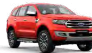
Colorado Red (Solid)