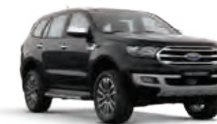
Absolute Black (Solid)